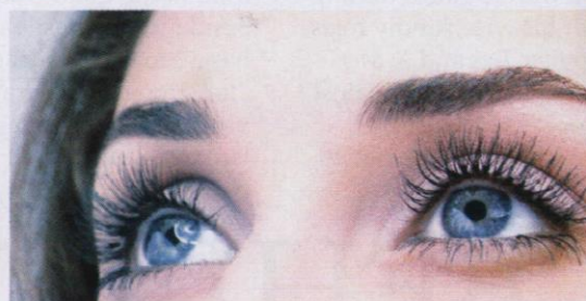
Once the implanted brows or lashes grow, they require regular maintenance and trimming.

Ideal candidates also include those who want to improve the thickness or the fullness of the eyelashes.