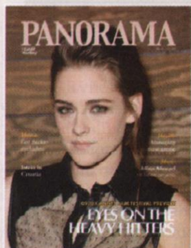
On the cover: Kristen Stewart